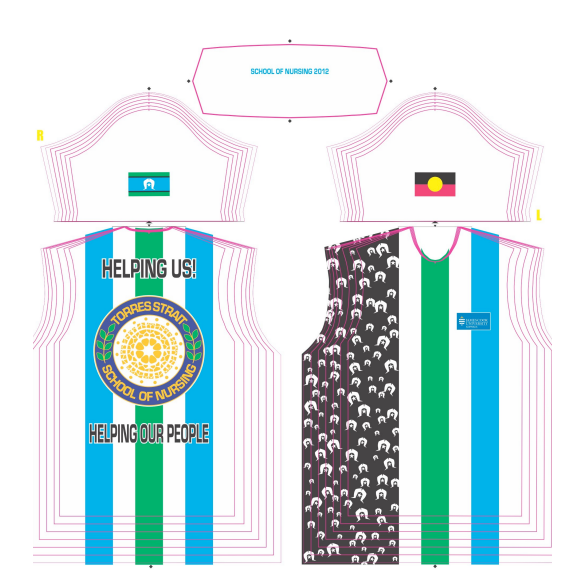
Figure 2: Student-designed polo shirt design

The consolidation of the mentoring circle group's identity was also assisted by an activity instigated by facilitators in earlier meetings. Students designed a polo shirt as a physical expression of group identity. Early sketches of the design drew upon the cultural heritage of the students and the history of the university on the island. Old and new elements were incorporated into the final design (Figure 2), which was an expression of student solidarity and their sense of belonging. The polo shirt was more than a tangible representation of the group's identity; it demonstrated that, by working together, students could achieve results and produce something useful. Membership in the group became a source of pride and differentiated nursing students as part of an 'elite group' (Artefact 41, line 375). The students began inviting other students to meetings.