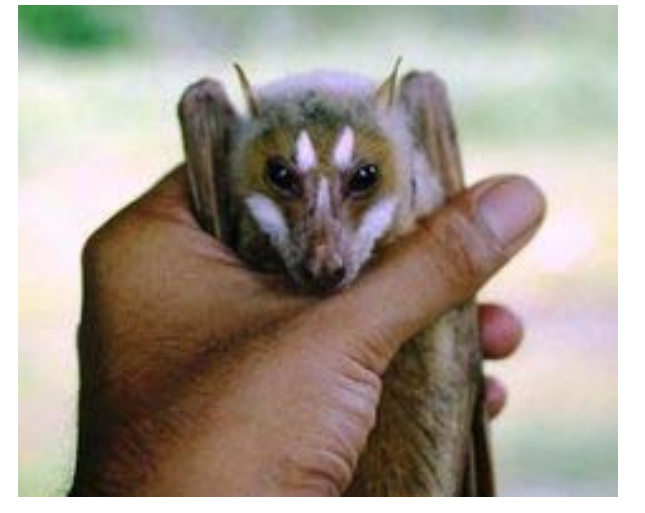
The Mindoro fruit bat, which has metre-long wings and was recently discovered in the Philippines. Click to enlarge

While it's tempting to giggle occasionally, cryptobiologists have made many valuable discoveries. These include recent finds such as the Mindoro fruit bat (pictured right) and the Laotian rock rat representing a completely new family of mammal - as well as so-called "Lazarus species" that were long presumed extinct. Examples of the latter include the coelacanth, okapi, Javan elephant and giant terror skink, among many others.