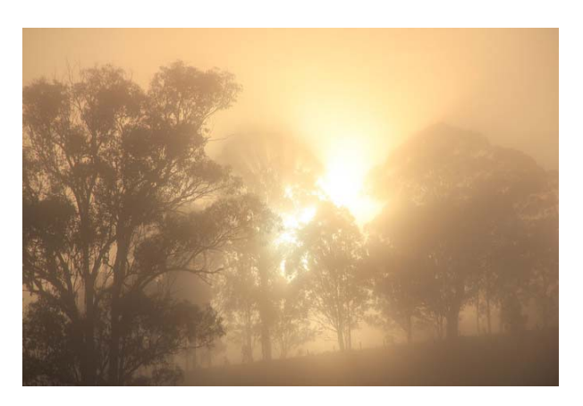
Woodenbong at sunrise: could a Yowie really be lurking in the surrounding woods?