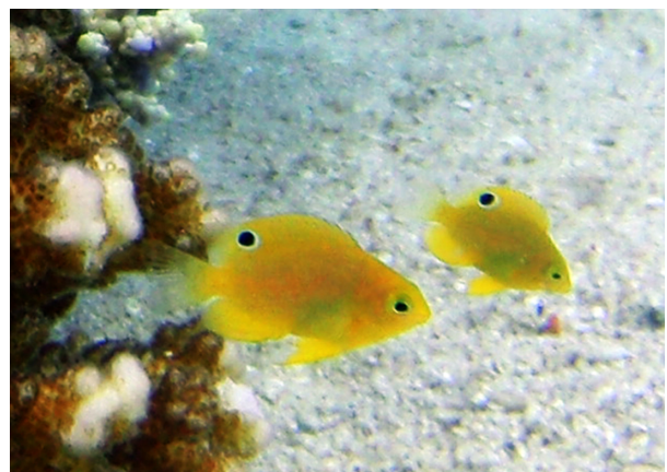
Figure 1. Newly settled juvenile ambon damselfish, Pomacentrus amboinensis . These are a common member of species diverse coral reef fish communities.

Studies of coral reef fishes have found that the pairing of skin extract from prey with a novel predator odor results in an antipredator response in conspecific prey