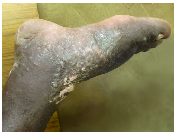
Figure 4 Skin lesions foot. Nodular epidermal changes associated with elephantiasis of right leg (medial view).

may still be occurring in this remote area. Prior to April 2011 the patient had been seen purely as a clinical case and the public health implications had been ignored. However, once the local health professionals were made aware of the programmatic significance of the case, they were adamant that the index case's community be investigated for active transmission of W. bancrofti .