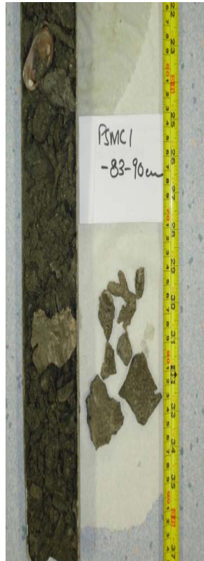
Figure 3 Core N2-3 (labeled below as PCMS1) sectioned and showing interval where clasts for N2-3 -85cm were selected

(‰ value) using an Optima Duel Inlet mass spectrometer. This value was used for isotopic correction in the calculation of the conventional ^{14}\text{C} age (yr BP) for each sample.