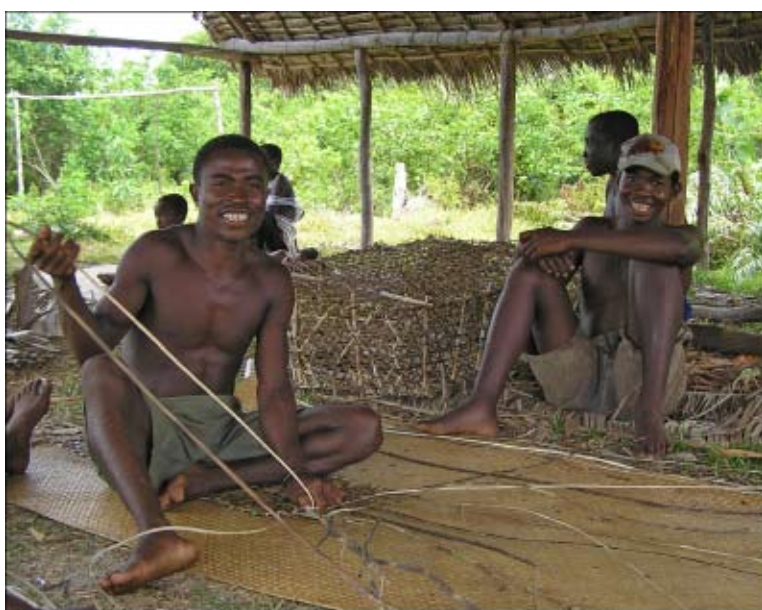
Figure 3. Trap construction in Tanjona MPA.