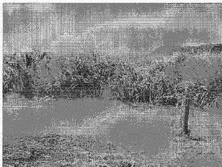
Figure 1. A picture of sugarcane variety 136 grown in the Mackay region.

cycle. The ability to better predict these characteristics offers the potential to improve yield forecasting models. It is also important to recognise that some varieties are more susceptible to disease. The ability to accurately classify varieties can help enormously to reduce negative impacts associated with disease spread.