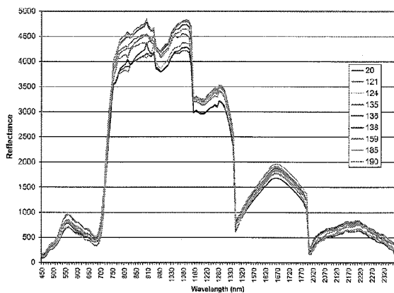
Figure 2. Spectral signatures of nine different sugarcane varieties.