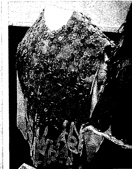
Donna Foley's Transsubstantial investment EM453071