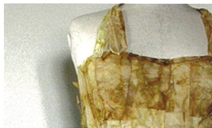
Joanna ANGLESEY - Duologue Vestments By definition 'vestment' means a garment or clothing. My work celebrates the very impressive female component of the current PTRG staff. The materials used refer to dialogues over cups of tea, and the colonial origins of the PTRG building.