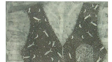
Glen SKIEN - Ophelia's Vests These three images are from a series of etchings and mixed-media works which present the vest as a map of the journey of the psyche of Ophelia.