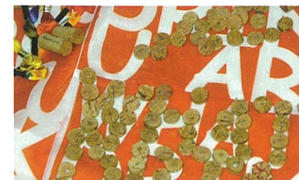
Donna FOLEY - Transubstantial investment The wine/blood transubstantiation in communal religious celebrations of life and death is a legacy of primitive sacrificial rituals. Such ritual behaviour has a meditative function in dealing with uncertainty and anxiety in defined spaces both sacred and secular.