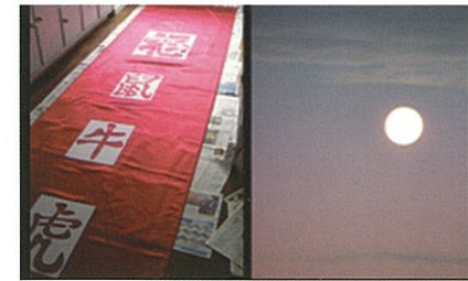
Erwin CRUZ - personal investments As a genetic fingerprinting resource for accumulative thoughts, emotions and nostalgia, the basic structure of the DNA model has influenced my artwork despite its scientific origins. The word play echoes the themes of the exhibition.