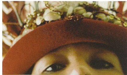
Cerise JAZZ - Bird of Paradise Borne on the winds of a pulse... set adrift on the flickering spectacle of the imagination, luminous exotic flesh, silk under the fingers, caress evoking the unwritten memoirs of the night ocean