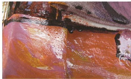
Barbara PIERCE - Cornered sleeves A few folded sleeves contained in a corner - a fragment of order. Motif and colour are used in traditional costume for identification, or for religious or other cultural purposes. The focus on specific parts of garments depends upon purpose.