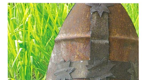
Richard GILLESPIE - Safe in vestments Some questions: art and religion - both products of the imagination? Why are we here? Is it safer to choose a religion over agnosticism, as it is safer to don a steel hard hat in battle, when more wars are fought on the basis of religion than any other cause.