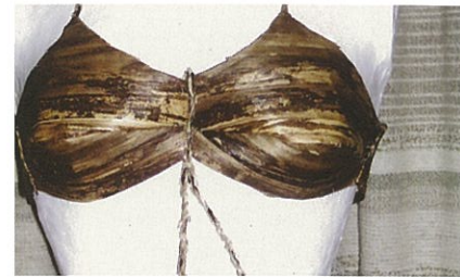
Dinie GAEMERS - Resort Wear Resort Wear is manufactured under the label "Banana Country". Material used comes from the trunk of the banana palm, usually destined for the dump. The exhibit is of a 'non-wearable' nature.