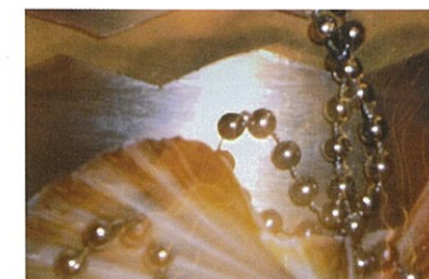
Janne BOGOMIAGKOVA - The Venus vest plate. Oh Brad! I just wanted you to notice me! ...a very versatile 'in-VEST-ment!' Inspired by...a woman true to herself in her pared-down graceful attitude - still alive in @! ...Some know very little about their breasts! Lift them up! The straps adjust!