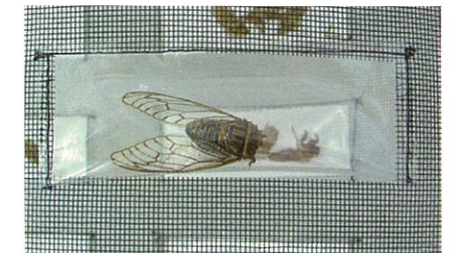
Judith DURNFORD - Drone Garments invested with personal reflections, memories and events.