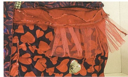
Sylvia DITCHBURN - Party Girl Mood Robes for Monitors with Attitude Brighten up your office space with a funky range of computer 'robes'. From Tropical Friday to Party Girl. Just imagine what a difference it will make to your work station.