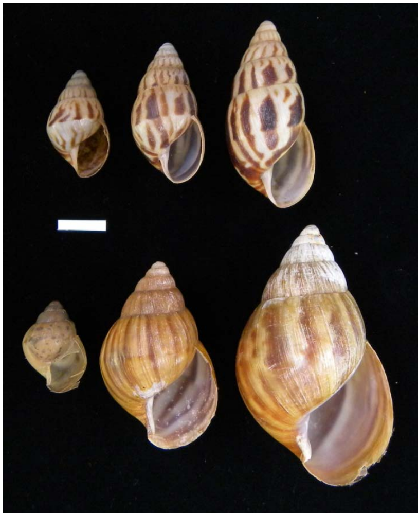
Fig. 3. Top row, Limicolaria flammea . Bottom row, Achatina fulica . Scale bar (white): 1 cm.

To date, we have not been able to conclusively determine the origin of this exotic species' introduction. The most plausible explanation would be that the snails (or eggs) were stowaways on exotic plants, since trade is a major pathway [17-18], particularly in a country such as Singapore where major air and shipping routes intersect. We hypothesize that L. flammea arrived together with an exotic plant, given the initial detection of these species in built-up areas with newly planted exotic trees. Washingtonia robusta , the exotic Mexican palm that individuals of L. flammea were first found with, is commercially available in Singapore. Our hypothesis is not unrealistic as more than 400 species of vascular plants in Singapore are native to tropical Africa, of which 259 species are known to be cultivated locally (K. Y. Chong unpublished data).