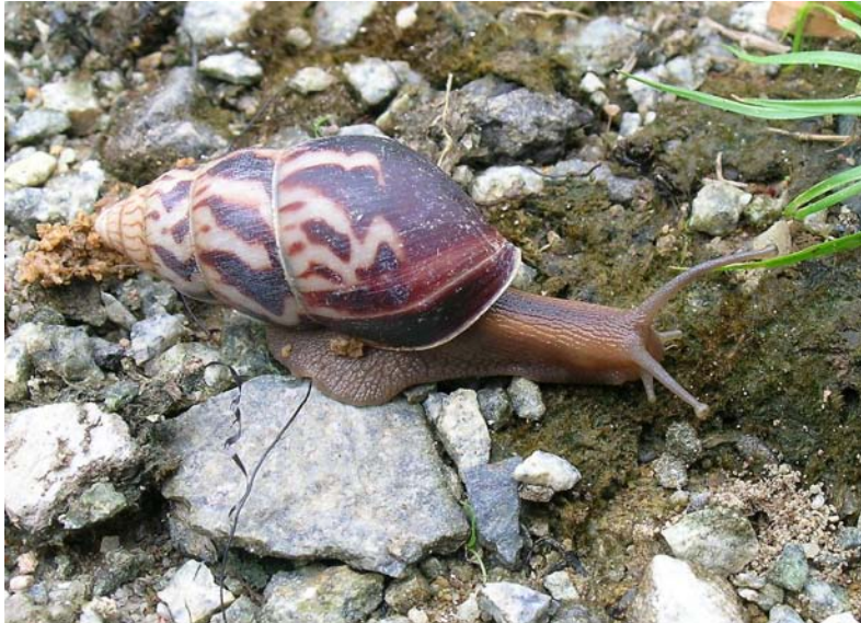
Fig. 2. Adult animal of Limicolaria flammea from Seletar West Farmway, Singapore.

Live individuals of L. flammea were found for the first time in Tuas South (Fig. 1b; about 6 km from the first site), which was a newly developed industrial area with little traffic and few human activities. Live individuals of L. flammea were found beneath dead leaves, underneath fallen fronds of wayside palm trees ( Washingtonia robusta ) native to Mexico, and under vegetation thickets along the pavement. A total of 72 individuals of different sizes and stages of maturity were recorded within a 50 x 50 cm quadrat placed at the spot with the highest snail density. Since the initial discoveries at Tuas in 2006 and 2007, additional surveys at four out of 10 sites (Fig. 1c,d,e,f) yielded live L. flammea individuals.