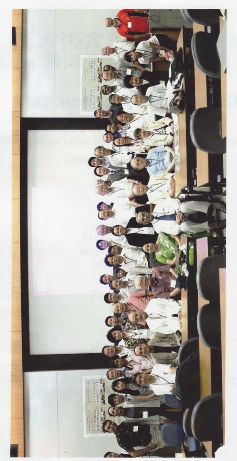
ICOA-7 group photo at NAOJ Auditorium (8 September, 2010)