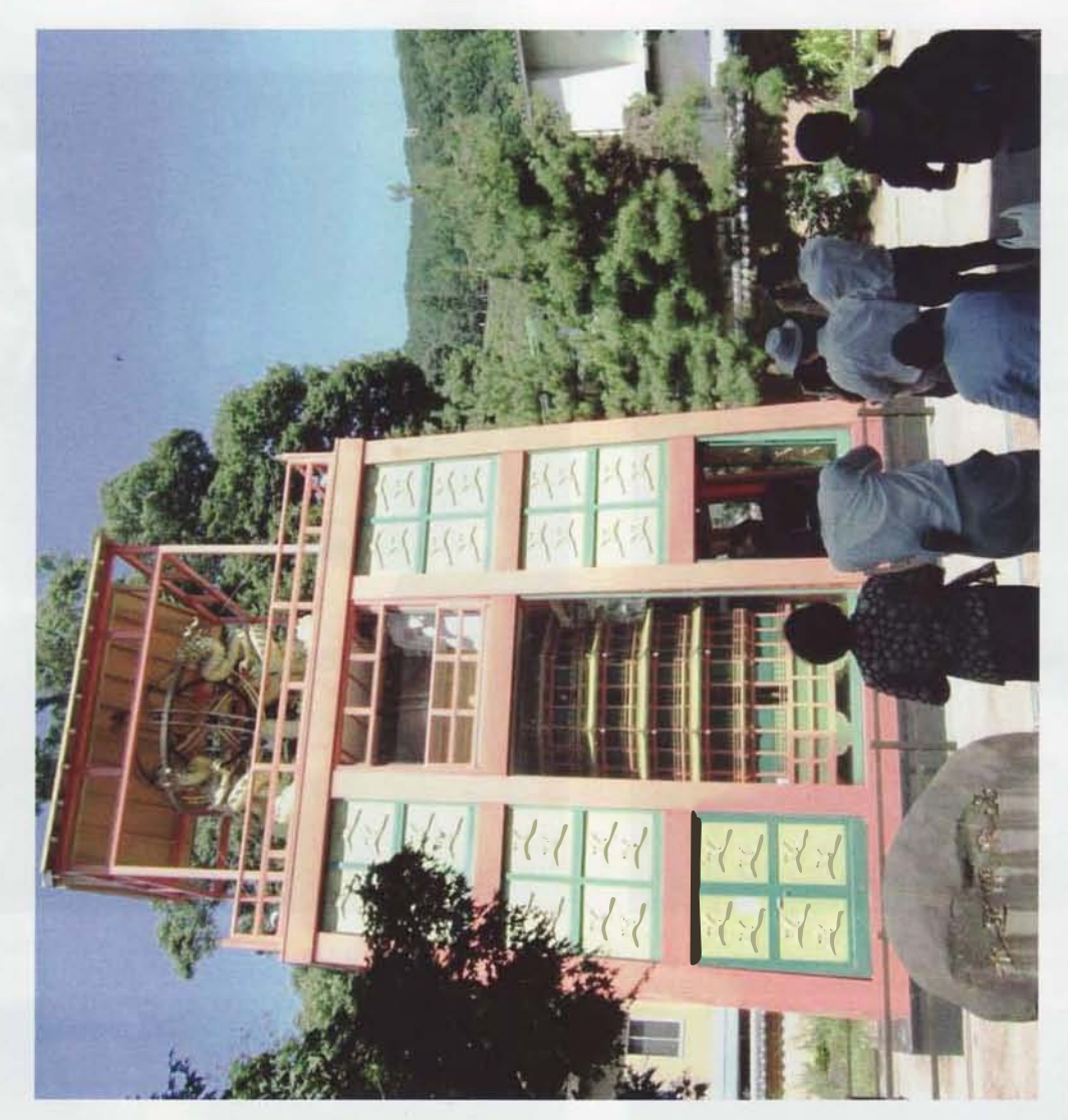
Left: Nobeyama Radio Observatory Right: Gishodo Clock Museum (Suwa city)