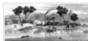
The lake scenery of Noosa, 1887