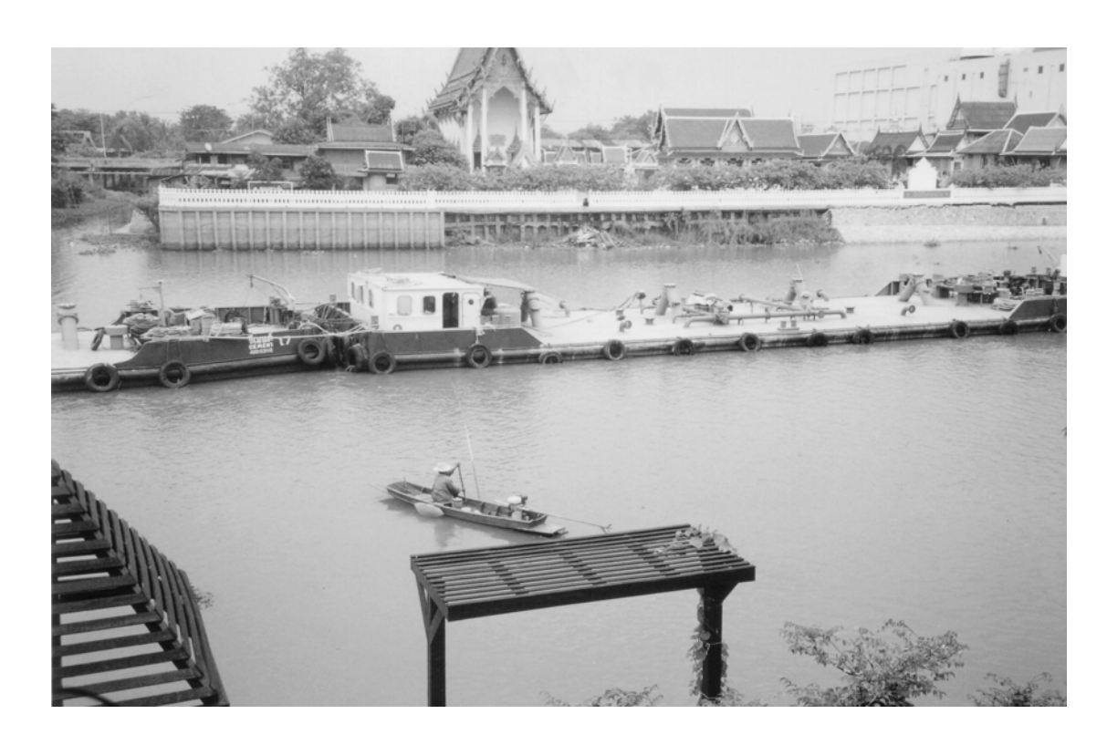
Plate 17: Barge transporting goods to Bangkok, fisherman in the centre foreground. Pasak River, Ayutthaya.

THIS IMAGE HAS BEEN REMOVED DUE TO COPYRIGHT RESTRICTIONS