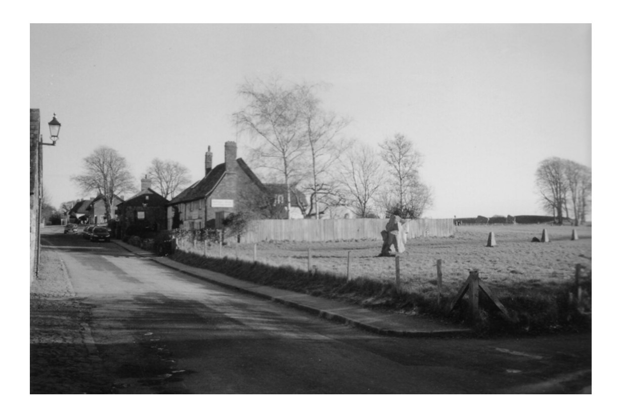
Plate 5: Avebury High Street, with a megalith in the foreground.