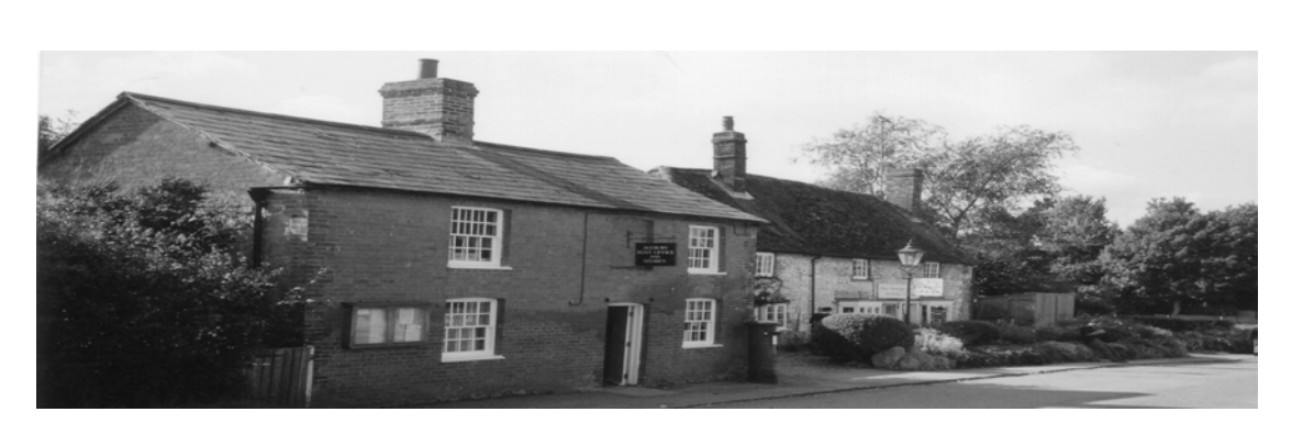
Plate 4: Post Office, Avebury