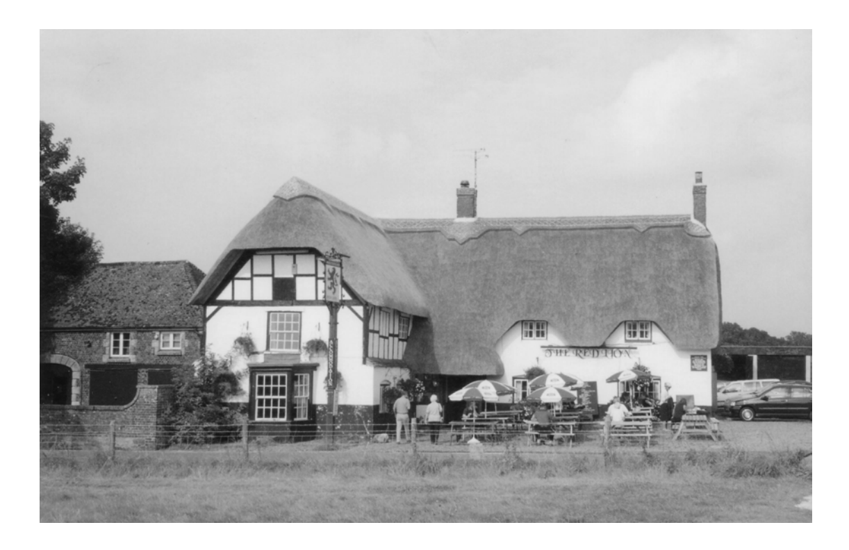
Plate 6: The Avebury pub, 'The Red Lion'.