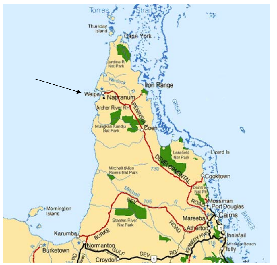
Fig. 1. This map shows Weipa and Napranum on the west coast of Cape York Peninsula, Queensland, Australia.

In the 1950s, bauxite was found in the area near where Weipa now stands. In response to this discovery, an agreement which provided for the granting of a special mining lease known as the 'Comalco Act' was signed between the Queensland government and Comalco (Commonwealth Aluminium Corporation) in 1957. This revoked the reserve status of 93 per cent of Aboriginal reserves in the Western Cape York area including the reserve of the Weipa South mission (as it was then known), which had been relocated to Jessica Point. The Aborigines of Weipa had no title to the land on which they lived nor to its mineral deposits, both being crown property. The Presbyterian Board of Missions renegotiated an area of only 308 acres immediately around the mission site as reserve. The mission population increased in 1963 when the