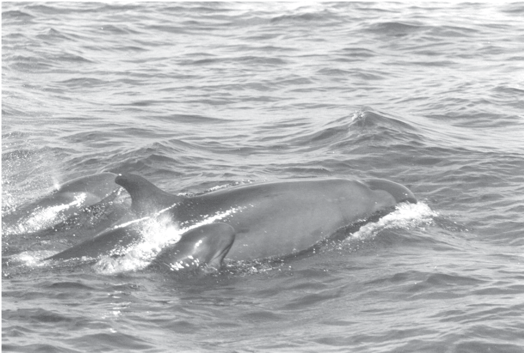
Figure 2. False killer whales sighted north of Koh Rong Samlaem Island; this group consisted of 45 (33 to 61) individuals and was the first record of this species for Cambodian waters.

Line-transect analyses were not possible as a result of the limited sightings obtained of each species. Based on the above surveys, however, the area with the highest encounter rate is the Koh Kong coastline from Koh Kong Island to the Thai border (0.41 cetaceans/linear km or 0.06 encounters/linear km surveyed). The offshore surveys (around Koh Tang and Koh Polou Wai archipelagos) show a higher number of cetaceans/linear