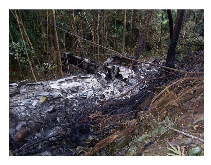
The w reckage of the plane at the crash site near Lockhart River.

The court emphasised that this is qualitatively different from other types of fishing activities: "it bears no comparison to the occasional fishing trip to which some urban dwellers recreationally aspire".