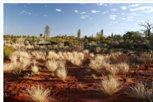
How sustainable is our system of land law?*

Most legal practitioners when hearing 'land law' mentioned will roll their eyes. Renowned as one of the most boring and archaic of the sub-disciplines taught in the law degree, they will recount their nightmares about the rule against perpetuities, future interests, and the doctrine of tenure.