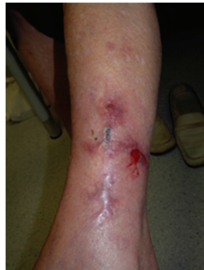
FIGURE 2: Successfully healed calciphylaxis following autolytic debridement and dressings along with treatment with cinacalcet and prednisolone in patient 4 who later died of myocardial infarction.

The histology of the skin biopsy of the patients was analysed histologically as depicted in Figure 1. The defining histological characteristic found in all the cases was extensive calcification of small and medium-sized vessels of the dermis and subcutis layer with typical calcific thrombogenic microangiopathy. The deposition of calcium in the