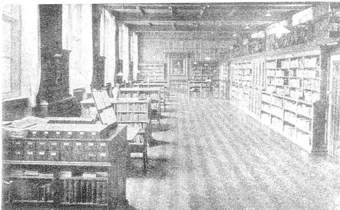
Cheltenham Ladies College: The Library in 1913 and in 1936.