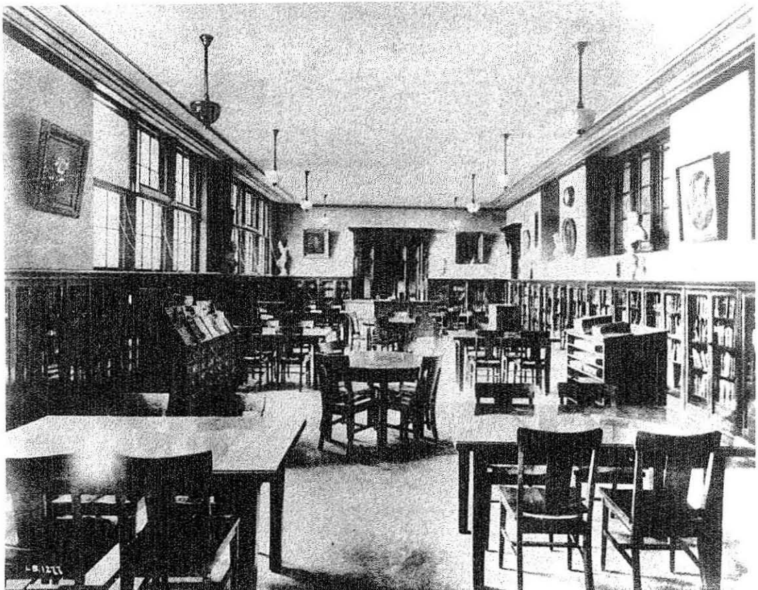
The library at Hutchinson Central High School, Buffalo, New York State, around 1919.