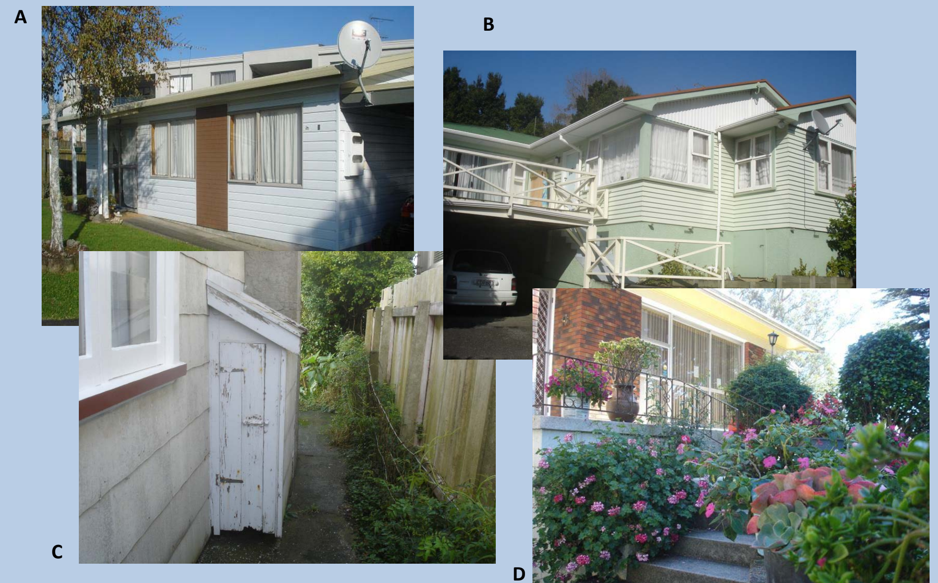
Figure 1 Participants' Houses (A. A state house where a participant lived; B. An adult-children owned house where a participating couple co-resided with their children; C. A private rental house where a participant lived; D. A children's investment property where a participant lived and looked after 5 tenants)