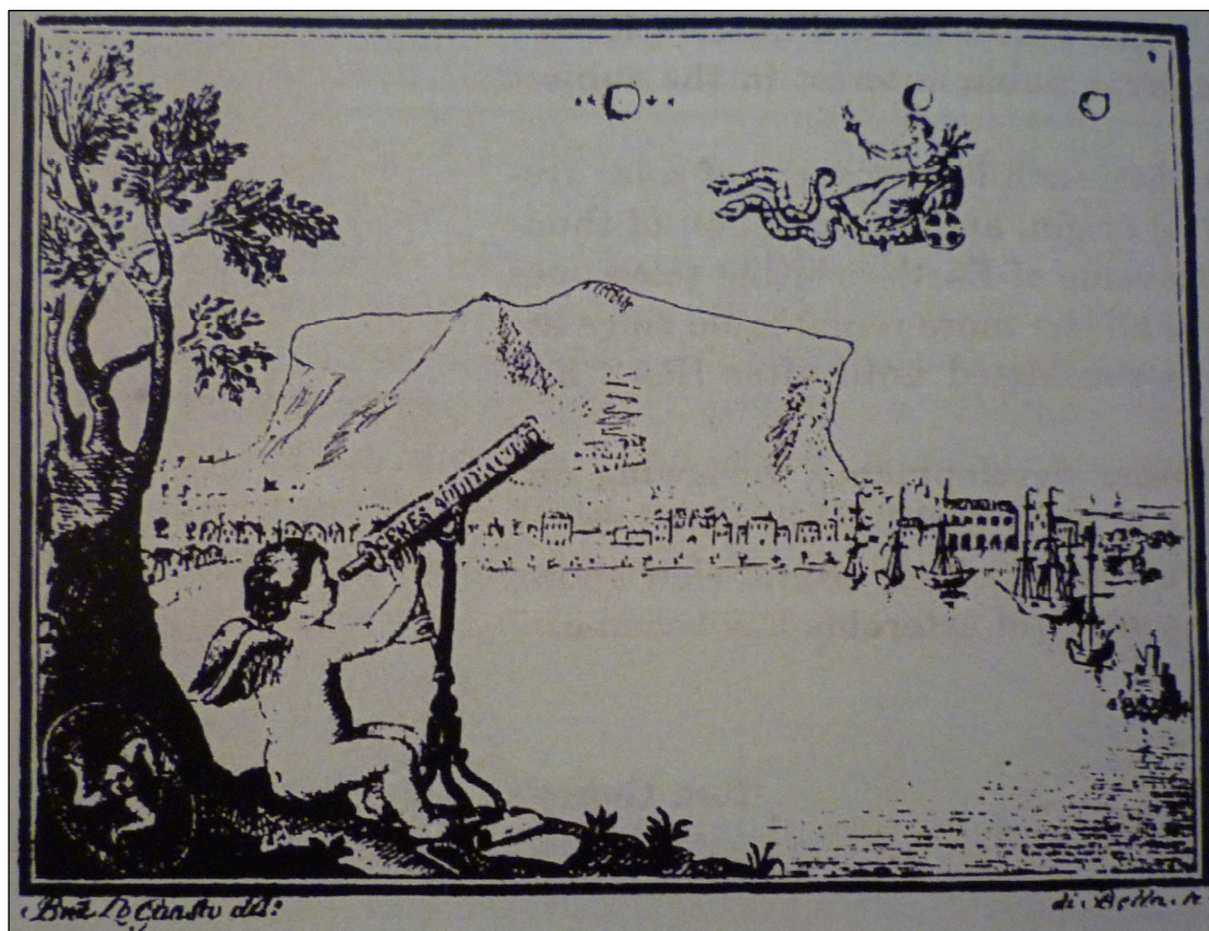
Figure 3: Engraving by Baron Lo Guasto on the title page of Piazzi's 1802 monograph about Ceres.