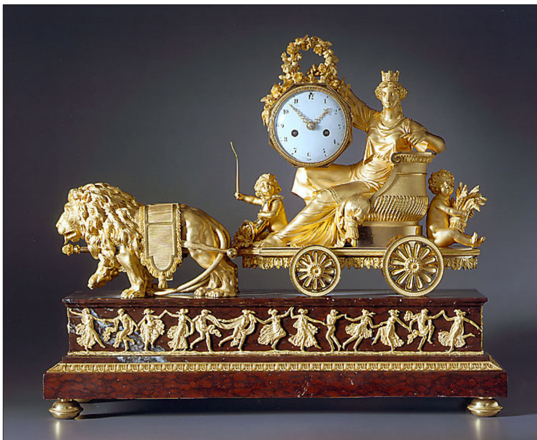
Figure 2: A clock, made in Paris in 1799 by Pierre-Philippe Thomire. Ceres wears a castle-shaped crown and long flowing dress, and is seated in her cushioned chariot pulled by a pair of lions. Ceres is flanked behind by a seated putto holding corn sheaves and in front by a seated putto with a cornucopia.