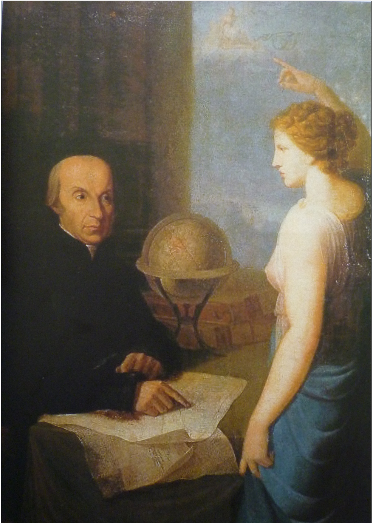
Figure 4: Painting by Francesco Farina showing Piazzi and Urania.