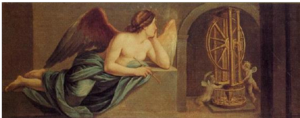
Figure 6: Painting of Urania and the Ramsden Circle.