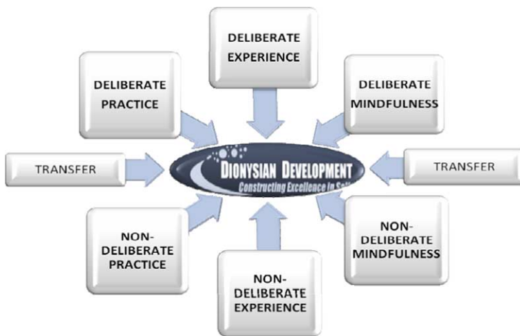
Figure 1. Dionysian development: complex-adaptive constructivist model of expertise

Mindfulness is a means of paying attention in a particular way: on purpose and in the present moment. Langer (2000) defines mindfulness as a ‘flexible state of mind in which one is actively engaged in the present, noticing new things and sensitive in context’. We suggest a necessity for mindfulness and a generalised state of alertness to both the activities one is engaged in and the situational surroundings is required to achieve your potential. Hauw and Durand (2007) have raised the profile of context ‘performance’ mindfulness in their situated analysis of problems in competition for elite trampolinists, where they identified factors such as ‘solving problems quickly