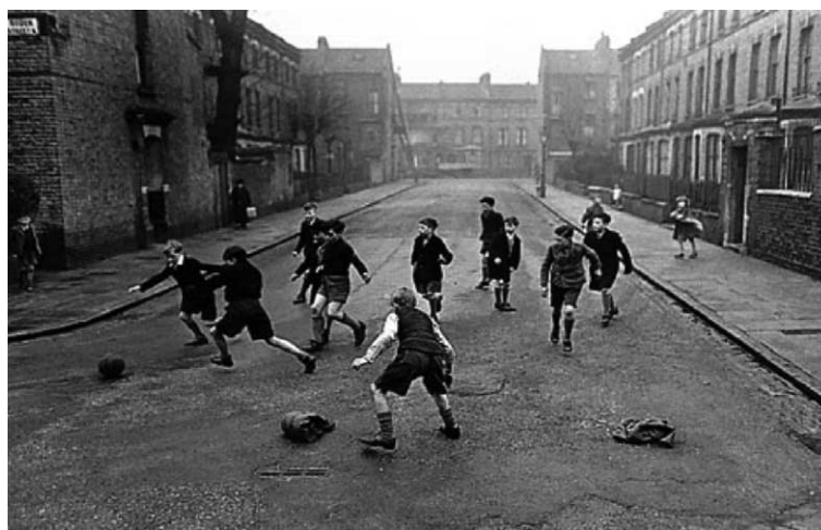
Figure 2. Children playing football in a street in London during the 1950's Source: The Independent, Monday 14th January 2008; www.independent.co.uk

Theoretical perspectives based on ecological psychology, dynamical systems theory and non-linear pedagogy support this and explain how TGfU lessons facilitate improvements in game performance (Chow et al. , 2007) They contend that human intentions are 'embodied' and constrained by a number of factors including mind, body, social and biological contexts (Davids et al. , 2008). Moreover, they propose that movements emerge from the interaction of these constraints with the task (the equipment, rules and boundaries of the game) and the environment (the surface, weather, light). When teachers modify games (manipulate task constraints), set problem-solving tasks and apply questioning techniques, pupils explore a variety of movement solutions within authentic contexts and, as a result, goal-related, decision-making behaviours emerge without the need for prescriptive instructions. It is interesting that a recent Norwegian study (Fjortoft, 2004), 'Landscape as playscape: the effects of natural environments on children's play and motor development', has shown that physical activity play in a natural environment