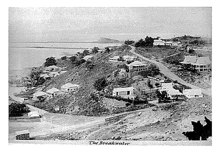
The Breakwater looking across Melton Hill, c.1900