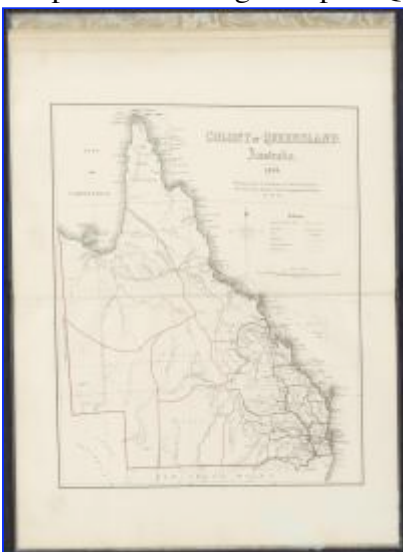
General Map of Queensland, showing Districts proclaimed as Electorates, &c.