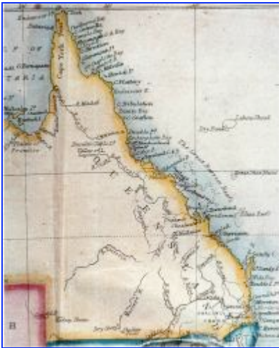
Edward Stanford's map of Queensland, 1861