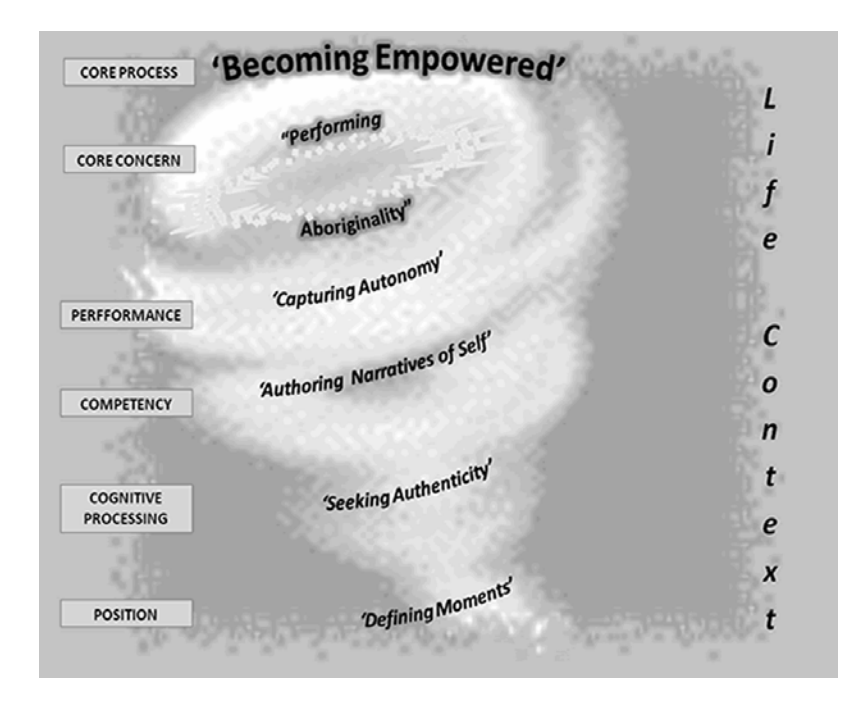
Figure 1: Process of "Becoming Empowered"

Glaser's [5] causal-consequence model was adapted to identify what the process looked like – the causes, conditions, strategies and consequences. It depicted four facets, Defining Moments, Seeking Authenticity, Authoring Narratives of Self and Capturing Autonomy (See Figure 1). The process was not a seamless transition and best illustrated as a dynamic, experiential, fluid, open process of becoming - a reiterative spiral from which entry and exits may be made at differing points and in which transgression, progression and regression occurs. It was non-linear; facets overlapped and replicated throughout the life course at various intensities; and variously, some facets and/or their components were omitted.