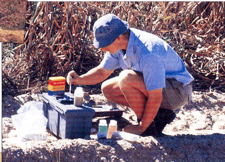
Sodic Soils Field Kit