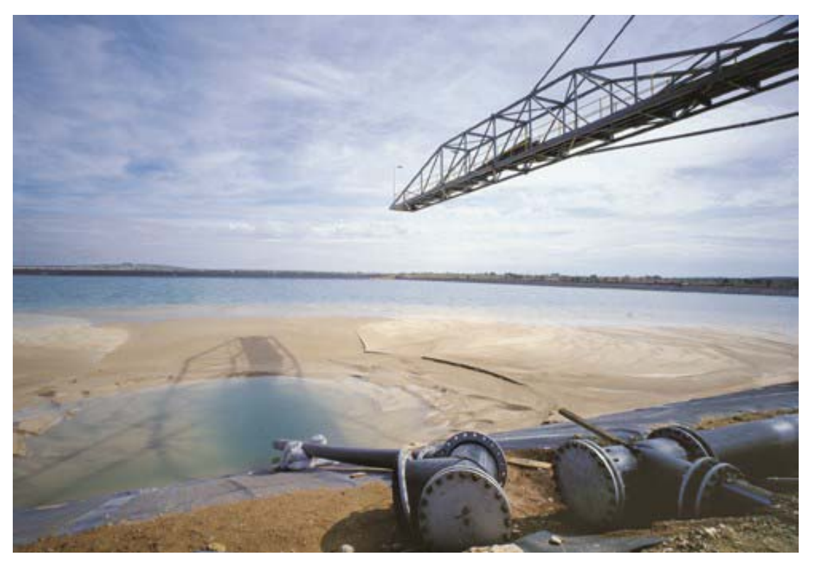
Plate 1.2. Phosphate Hill PG Stack (Cells 1 & 2) October 2000