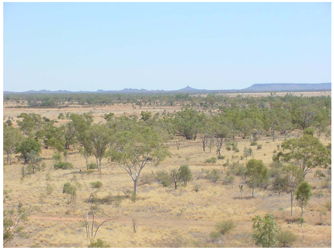
Plate 1.3. A view of the Phosphate Hill area, looking north towards The Monument and Mt Bruce. North-western slopes of Phosphate Hill in the foreground with black soil plains in the centre and typical low-moderate relief landforms on the horizon.